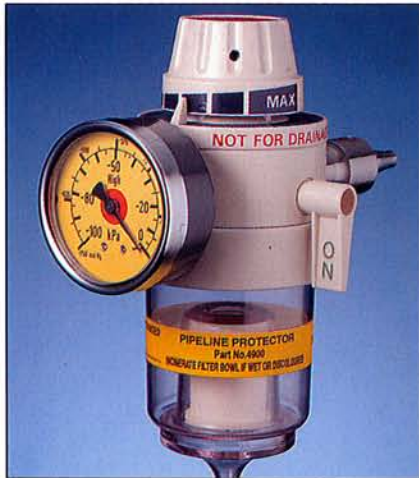
HIGH-DIRECT (PART No. 4701)