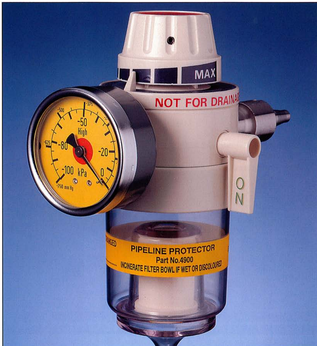
HIGH SUCTION CONTROLLER - DIRECT - PART No.4701