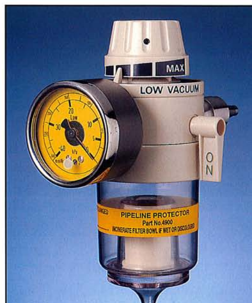
LOW CONTROLLER - PART No.4720