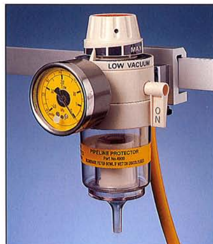
LOW-RAIL MOUNTED (PART No. 4725)