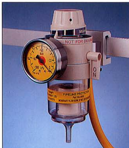
HIGH-RAIL MOUNTED (PART No. 4705)

(WITH PROBE FOR DIRECT FITTING INTO WALL OUTLET)