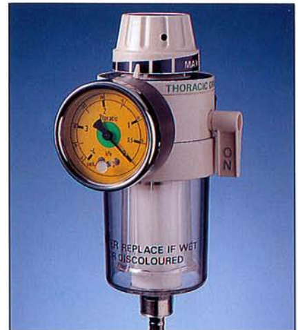
THORACIC-DIRECT (PART No. 4740)

(WITH PROBE FOR DIRECT FITTING INTO WALL OUTLET)