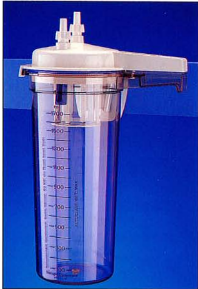
(PART No. 4800)