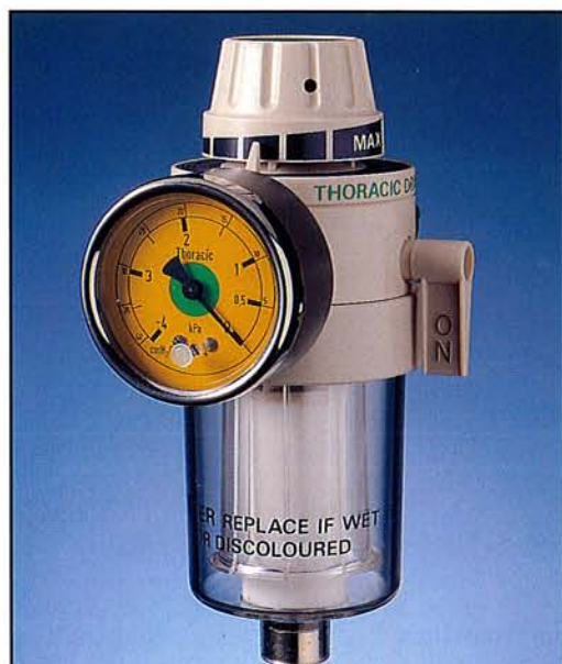
THORACIC CONTROLLER - PART No.4740