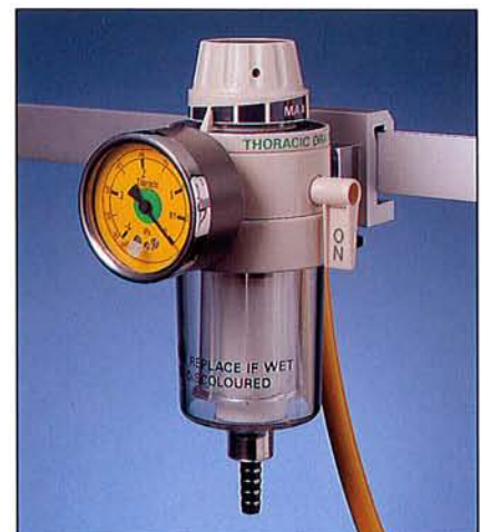
THORACIC-RAIL MOUNTED (PART No. 4745)

(WITH CLAMP AND INDIRECT HOSE – RAIL MOUNTING)