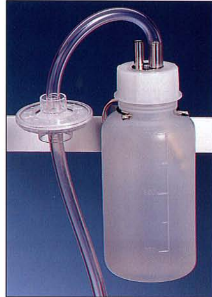
(PART No. 4508)

The Therapy Equipment 1.8L Suction Jar (PART No. 4800), is manufactured in polysulphone, and is autoclavable up to 160°C.