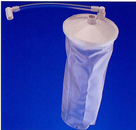
(PART No. 4807)

The Therapy Equipment Disposable Suction Liner is used in conjunction with the Therapy Equipment Suction Jar.