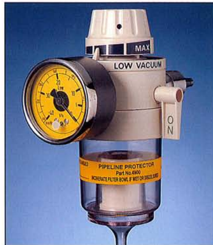
LOW-DIRECT (PART No. 4720)